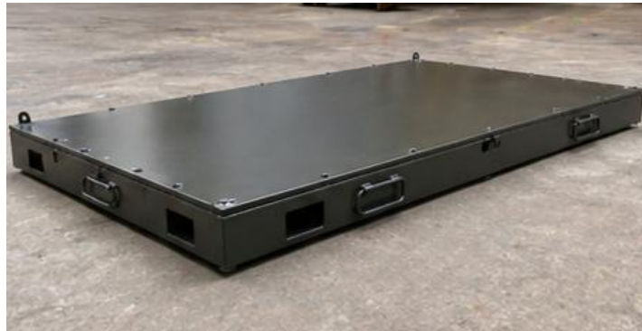
Mine Detection Module