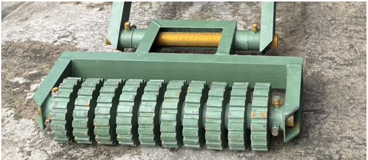
Mine Clearing Module